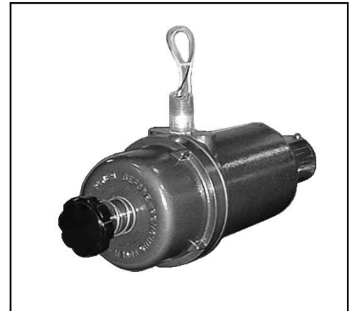
ECCA, Style A

NIKKISO Hydroflo's Electronic Capacity Control (ECCA) permits the automatic adjustment of pump capacity. Replacing the standard manual micrometer knob and mounting directly on the pump, the ECCA uses miniaturized, state-of-the-art electronic technology built around an AC synchronous motor. This permits precise actuator travel, without hunting or overshoot. All ECCA units are supplied with color-coded wiring leads which simplify field installation, and are fully encapsulated to keep moisture out. The encapsulated wiring leads also eliminate the need to open actuator housing to accomplish field wiring.